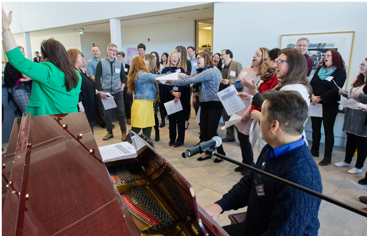
(Growing the Voices facilitates an "Instant Choir" team building event at Signal Hill Campus, Memorial University.)

Fuelling enterprises with the talents and skills of the arts.