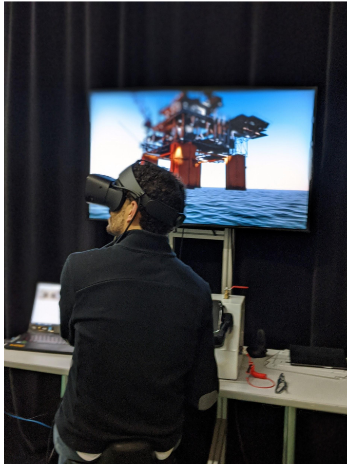
Experiencing lifeboat simulators at Virtual Marine. Feb 26, 2020.

Creating community, communicating the benefits of art/business collaborations, and inspiring our members.