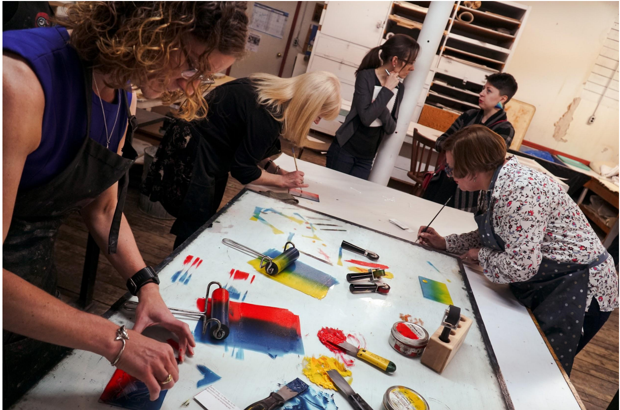
Guests had a chance to make their own print.

Connecting artists and the general public; deepening our understanding of how arts organizations work, and how they interact with the community.